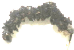
Bt infected caterpillars