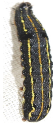
Oriental leaf worm Spodoptera litura