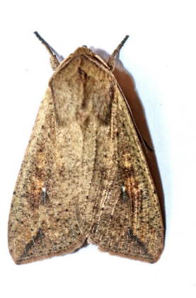
Oriental armyworm Mythimna separata