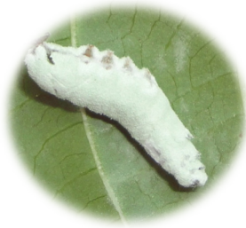
Metarhizium (=Nomuraea) rileyi