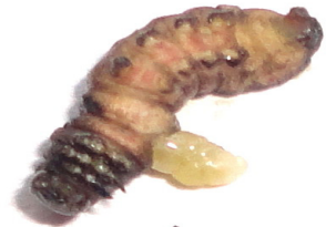
Ka jingiap u ksain S. litura na ka daw ba bam tyllong u khniang Chelonus formosanus