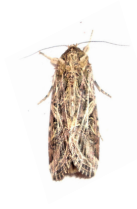
Oriental leaf worm Spodoptera litura