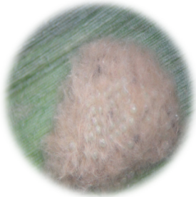
Pylleng jong u fall armyworm Spodoptera frugiperda

Ka long kaba kham jynjar ban pyniapher ia ki kynton pylleng jong une u khniang na kiwei pat ki jait khniang kiba iasyriem kiba ngi lah ban shem ha u jingthung riwhadem. Une u khniang u ju kha pylleng ha ki kynton ha ki bynta kaba shapoh jong u sla ne jyntang. Ia ki pylleng lah ban kha ha kaba shi syrtap ne bun syrtap. Ka rong jong ki pylleng ka long rong makhon ha ryngkat bad ka jingsop ki niuh lung ne teng teng khlem ka jingsop niuh lung.