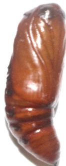
U Niang long

(Hadien 14-17 sngi ki kylla long niang long)