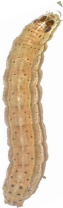
Fall armyworm Spodoptera frugiperda

Kumno ba une u ksain khun Fall armyworm u iapher ka dur ka dar na kiwei pat ki jait khniang kiba ia bam ia u jingthung riewhadem?