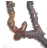
Baculovirus infected larvae