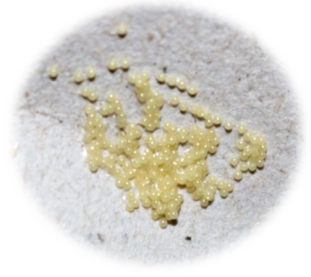
Pylleng jong u Oriental armyworm Mythimna separata