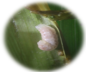
U ksain jong u Ichneumon wasp