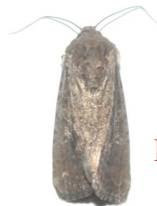
Ka Thabalong kynthei