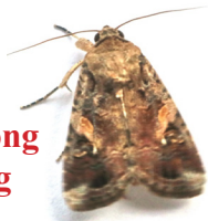
U Thabalong shynrang