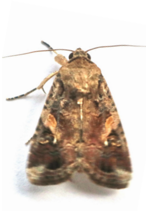
Fall armyworm (Shynrang) Spodoptera frugiperda

Kumno ba u iapher na kiwei pat ki jait thabalong kiba bam ia u jingthung riewhadem?